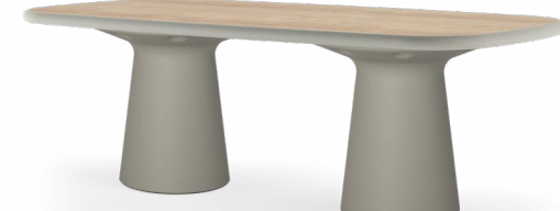
Ryno Combo table with 94.5 x 47.2in top 1RYPT6 31.5H | 94.5W | 47.2D (in) Standard weight: 218.2lbs Weighted option: 606.3lbs