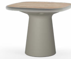
Ryno Combo table with 37.8 x 37.8in top 1RYTP1 31.5H | 37.8W | 37.8D (in) Standard weight: 70.5lbs Weighted option: 264.5lbs